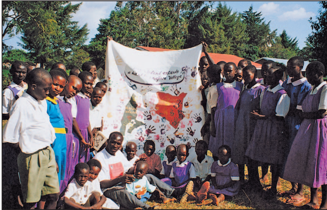
The banner, which traveled thousands of miles, is held up by Majiwa students.

In fact, educating girls may be the smartest way to bring families out of poverty. Girls who have been to school are more likely to have smaller families, and healthier, better-educated children. The benefits of this education range from being able to read instructions on pill bottles, to making better decisions, to getting a job.